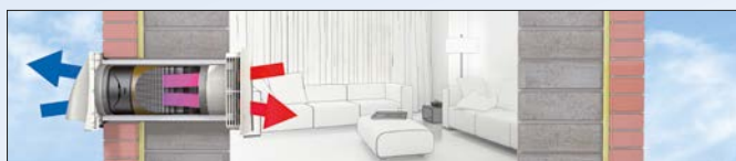
Stand Alone Operation

While one unit provides fresh air, at the same time the second unit transports warm, stale air to the outside. During this process, the heat energy contained in the waste air is stored in the ceramic element. After 70 seconds, the ventilators change their direction of flow. Both units communicate with each other via radio contact.